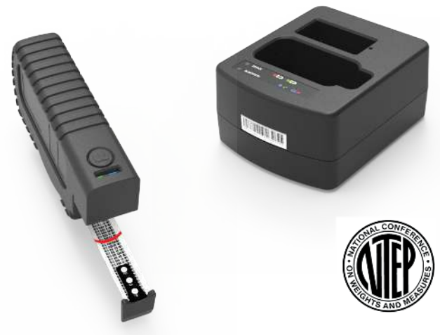
Cordless Scanning & Back Charge Protection for Shippers

Cubetape works readily with any shipping software (e.g. UPS WorldShip, FedEx Ship Manager, ADSI Ship-It, etc.) to eliminate the manual data entry of length, width and height. Besides reducing the labor burden brought on by the carrier dimensional weight changes, Cubetape accuracy eliminates the cost to your company of data entry errors. Cubetape also has value for LTL shipments since it can readily record the length, width and height of each pallet on a shipment. When printed on the Bill of Lading and signed by the driver, the dimensions can be valuable documentation to avoid post shipment billing adjustments by your carriers.